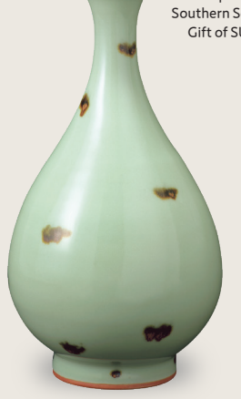
National Treasure BOTTLE, celadon with iron brown spots Yuan dynasty, 14th century Longquan ware Gift of SUMITOMO Group, the ATAKA Collection