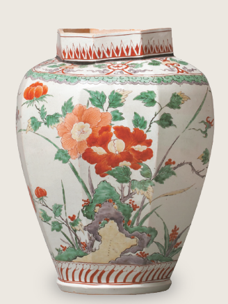
OCTAGONAL JAR, porcelain with design of peony and camellia in overglaze enamels Edo period, 1680–1710s Arita ware, Hizen